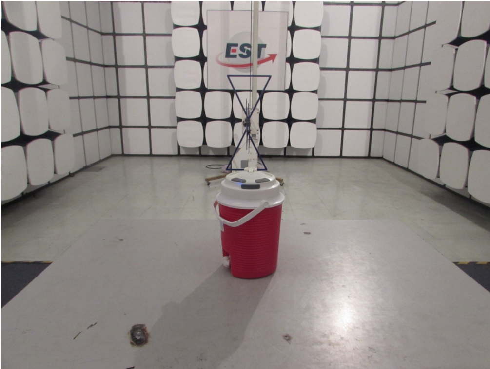
Radiated Test (1000-25000 MHz)