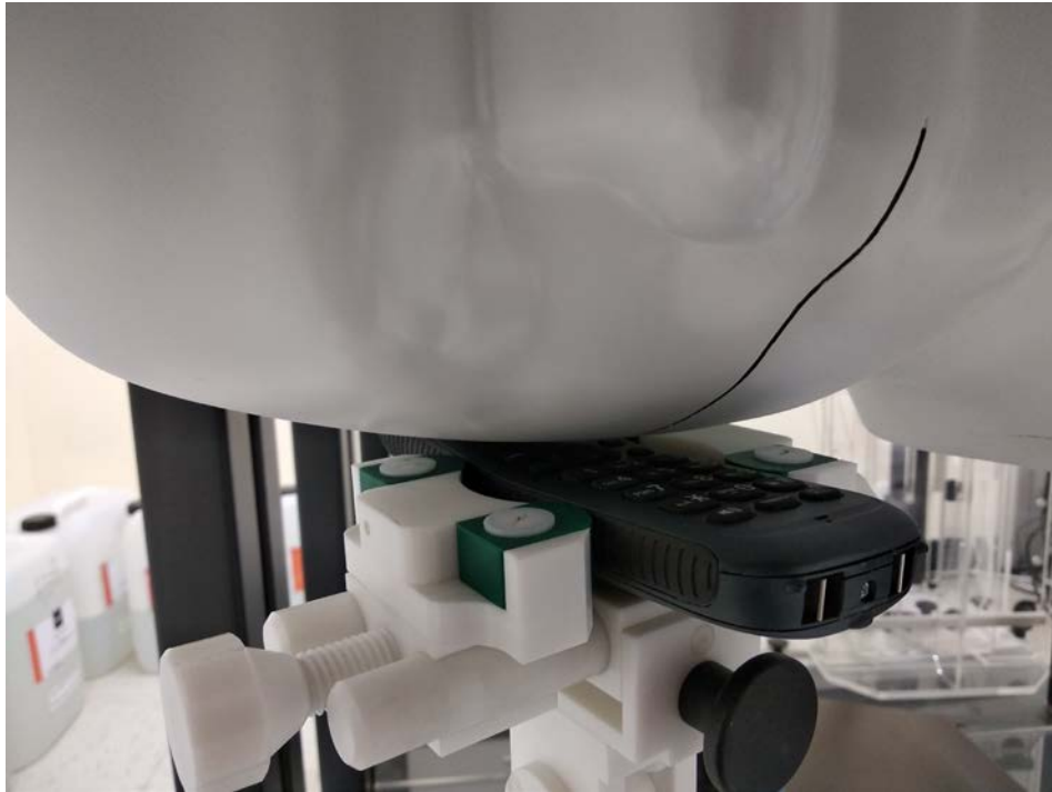
Figure 1 – Right Cheek