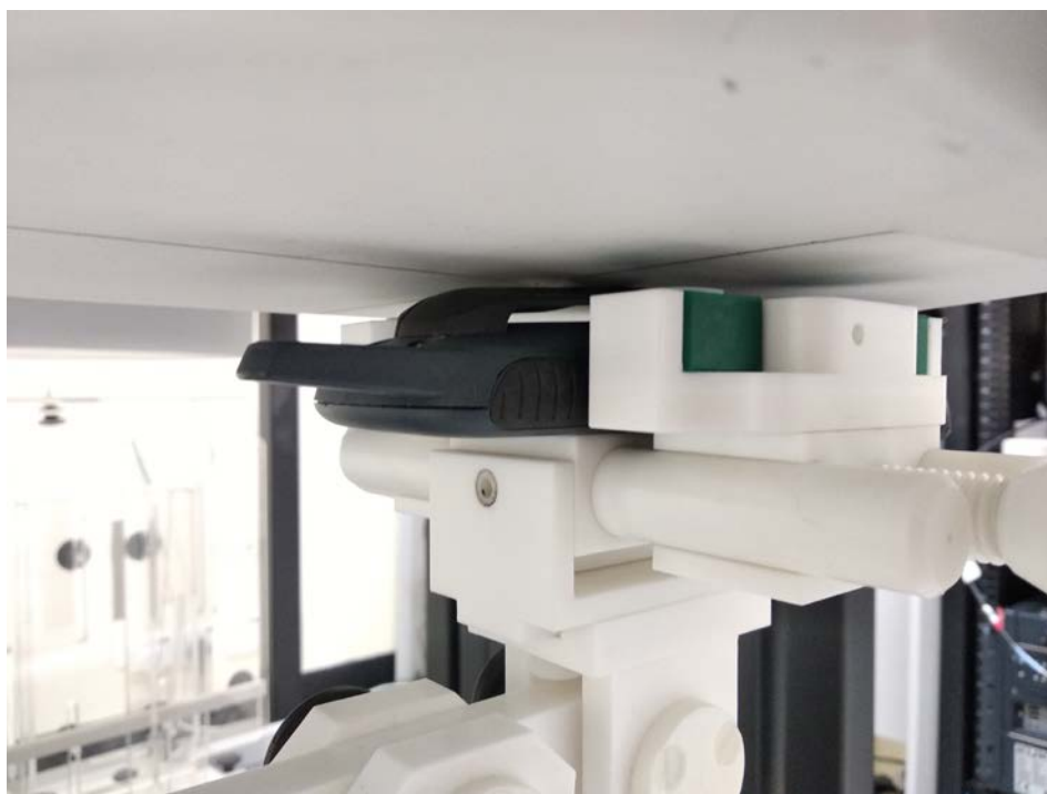
Figure 5 – Back surface with 0mm Separation