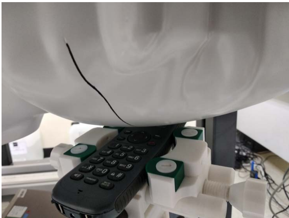
Figure 4 – Left Tilt