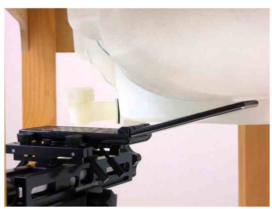
- Ear-Tilt Position -