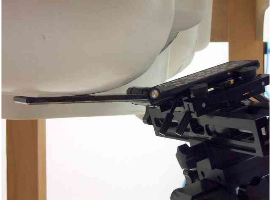
- Cheek-Touch Position -