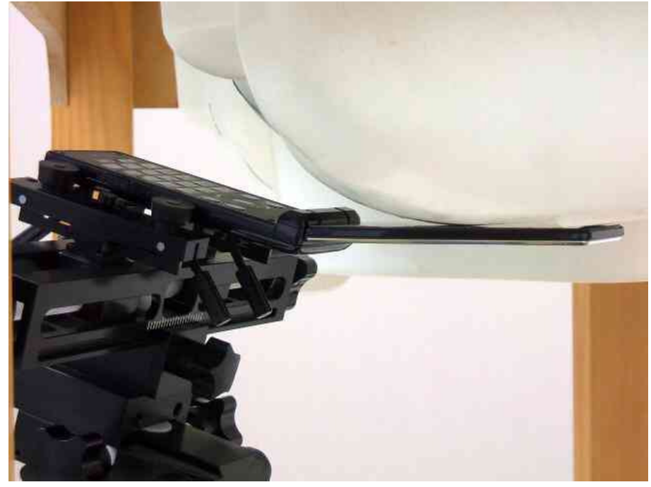
- Cheek-Touch Position -