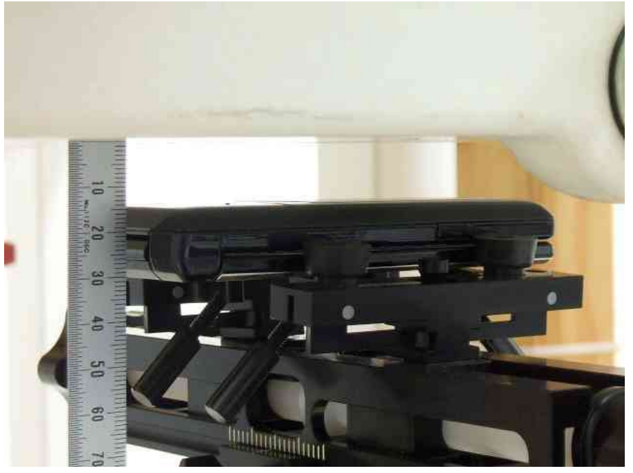
– Rear –