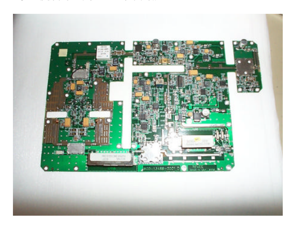
PCB inside the LNA/PA – Back View