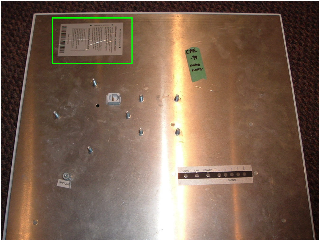
Figure 1 – External back panel, FCC Label location..