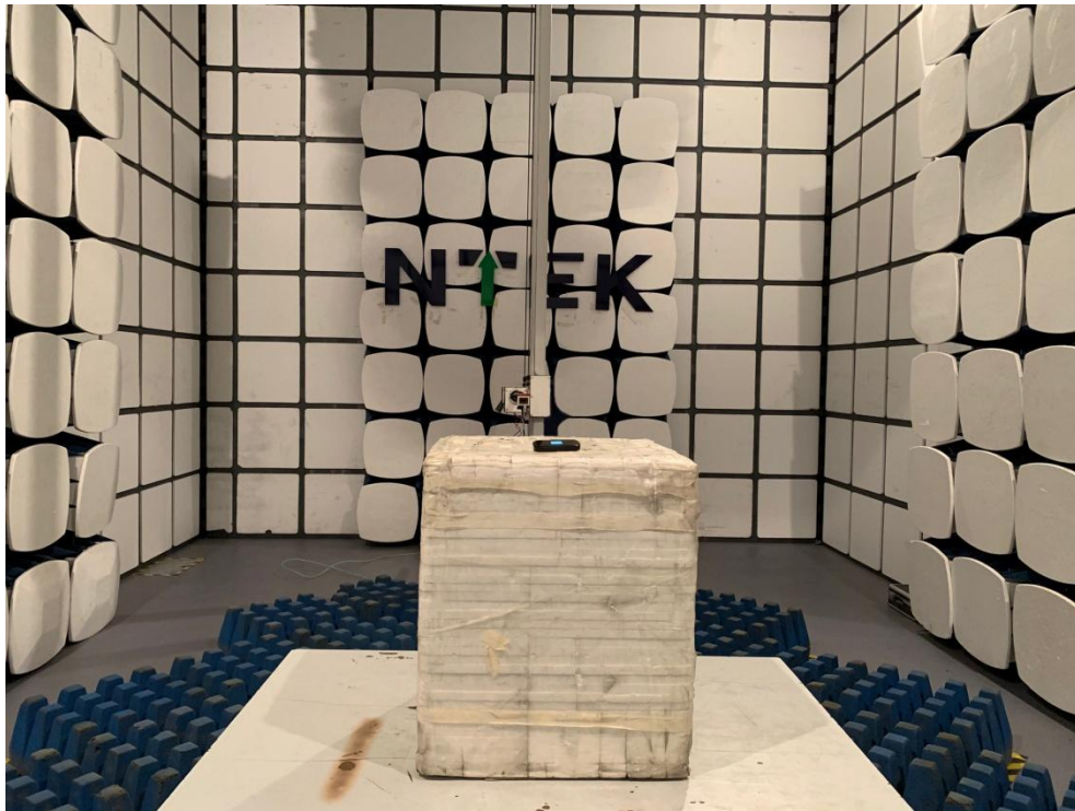
Conducted Measurement Photos