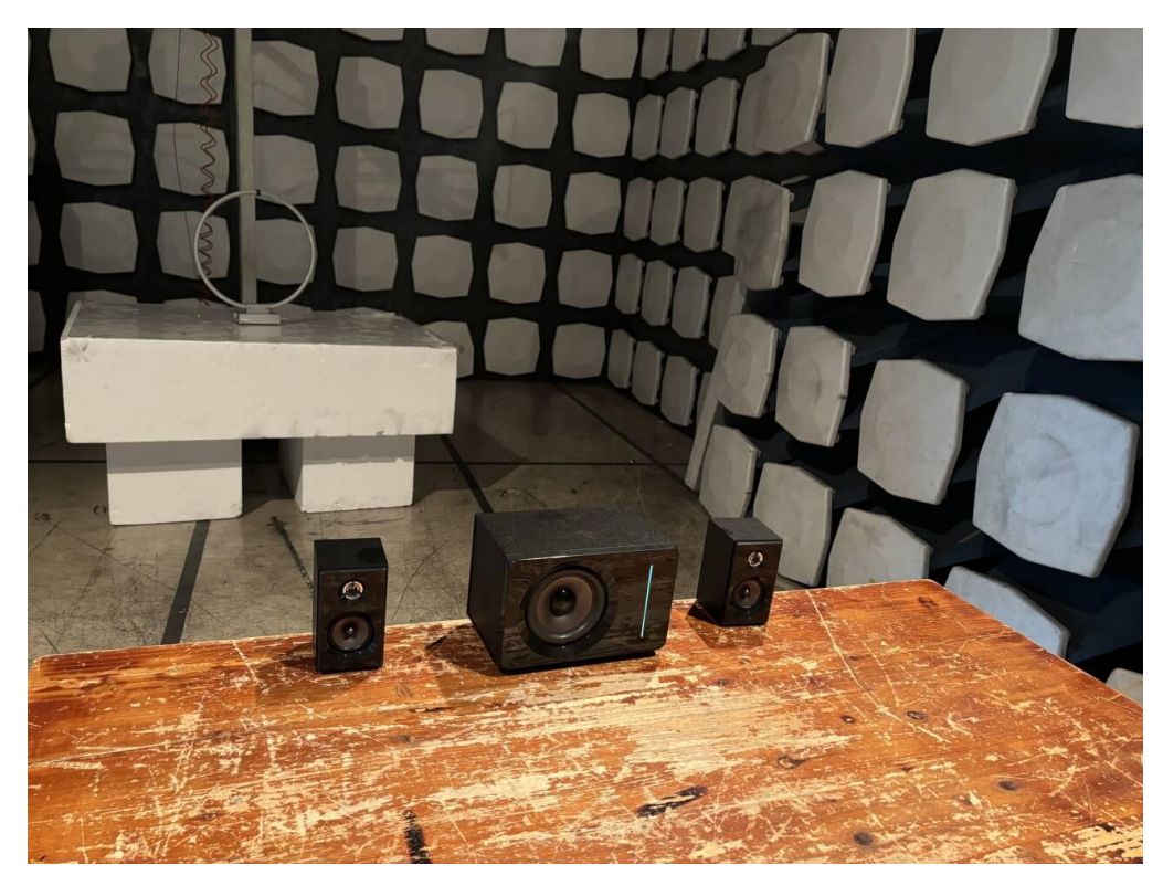
9kHz to 30MHz Radiated Spurious Emissions