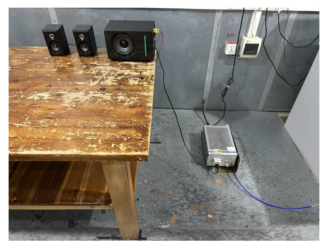
Conducted Emissions at Mains Terminals 150 kHz to 30 MHz