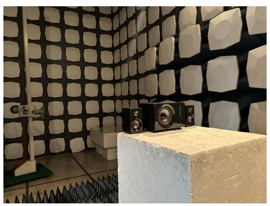
1 GHz to 40 GHz Radiated Spurious Emissions