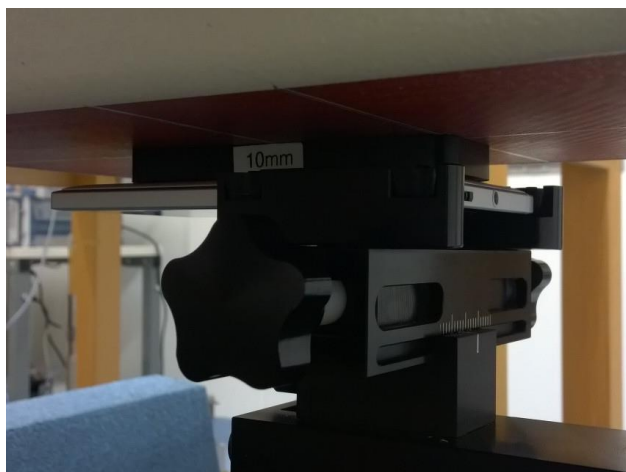
Photo of the device positioned for WR mode measurement –back facing phantom. The spacer was removed before the start of the measurements.

The device was placed in the SPEAG holder using the Microsoft spacer and, in sequence, the back, display and each of the 4 edges was positioned 10.0mm away from the flat phantom. The spacer was removed before the start of the measurements.