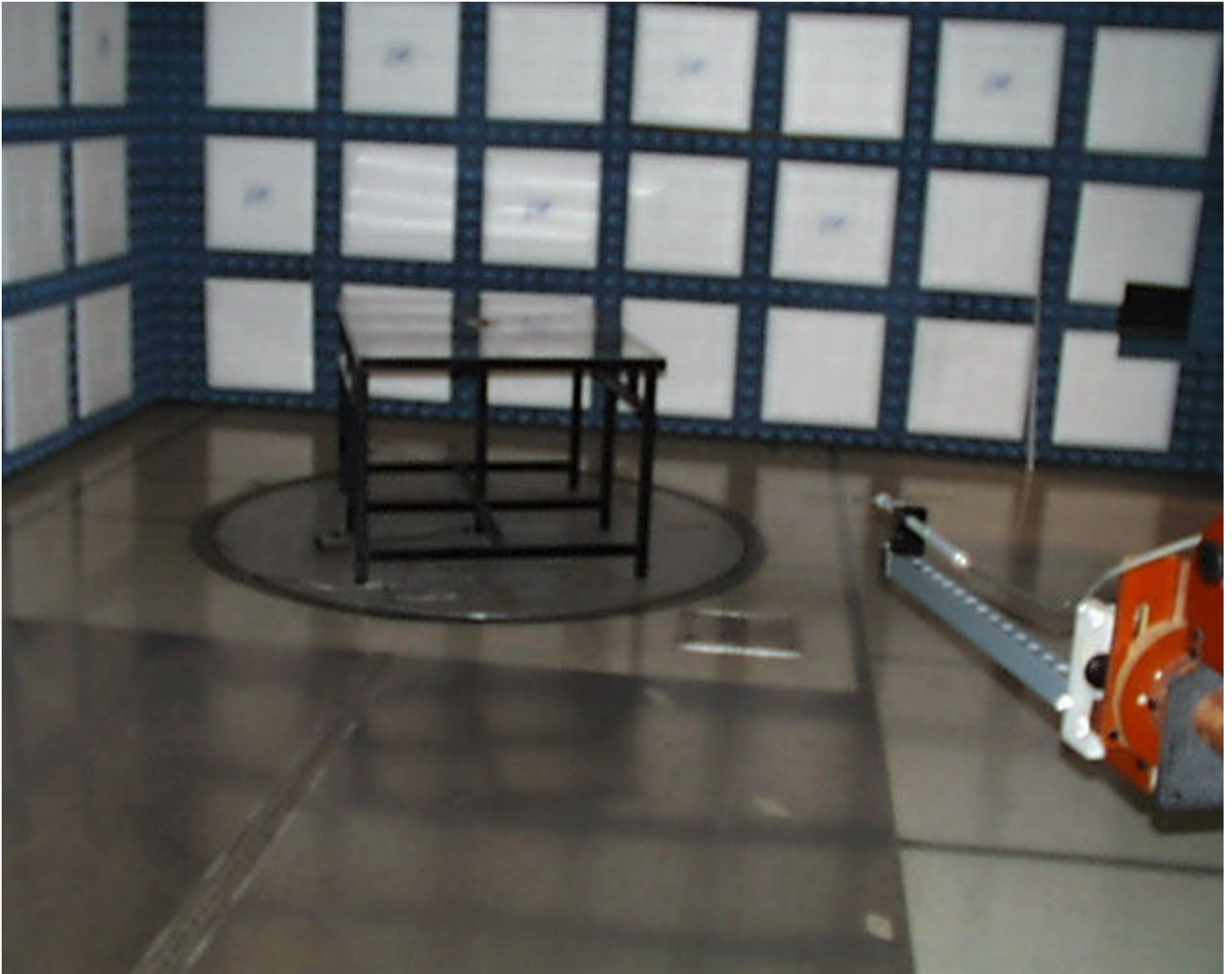
FIGURE 1A TEST SETUP

THIS REPORT SHALL NOT BE REPRODUCED, EXCEPT IN FULL, WITHOUT THE WRITTEN APPROVAL OF VERSUS TECHNOLOGY, INC.