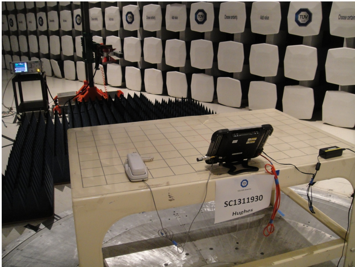
Figure 2 (1GHz-18GHz Back Picture)