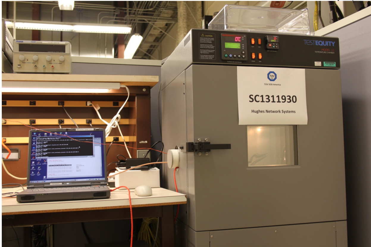
Figure 5 (Frequency Stability)