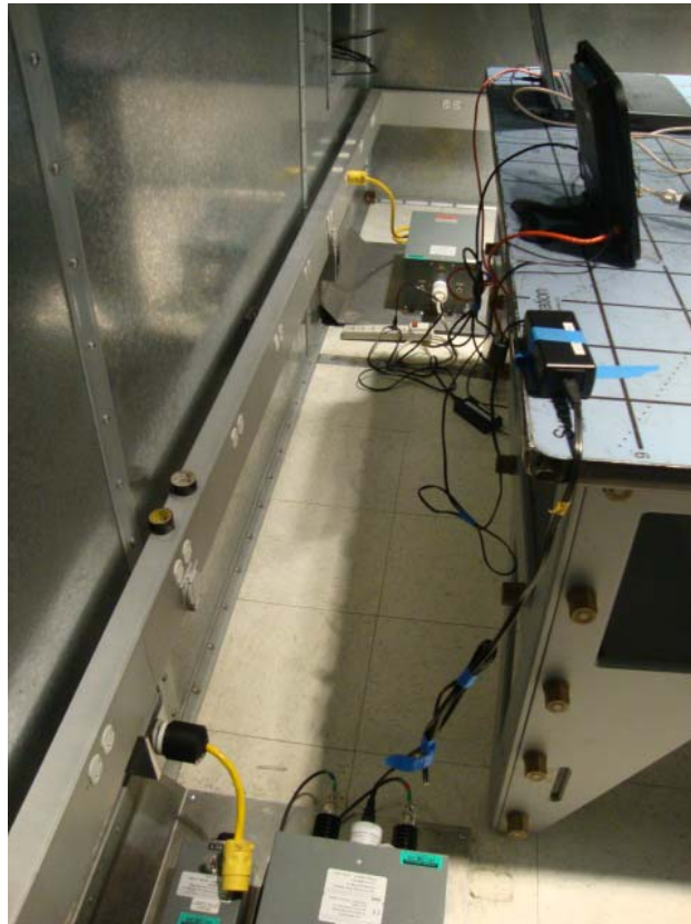
Figure 6 (Conducted Emissions)