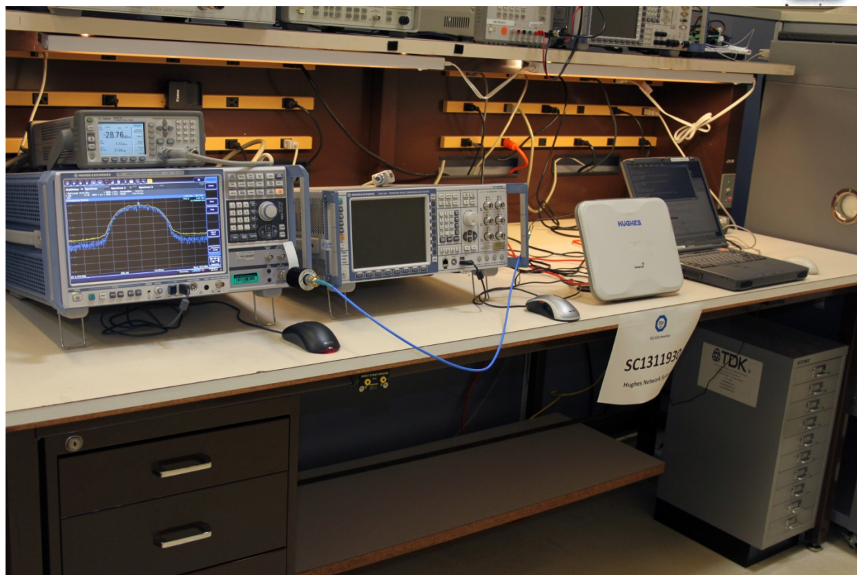
Figure 4 (Conducted Port Measurements)