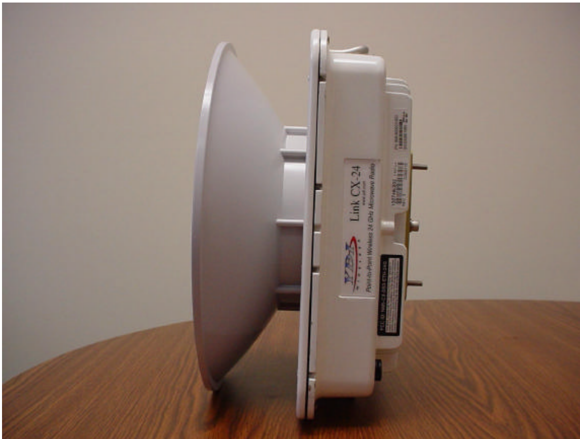
Photograph of EUT – Side view showing labels