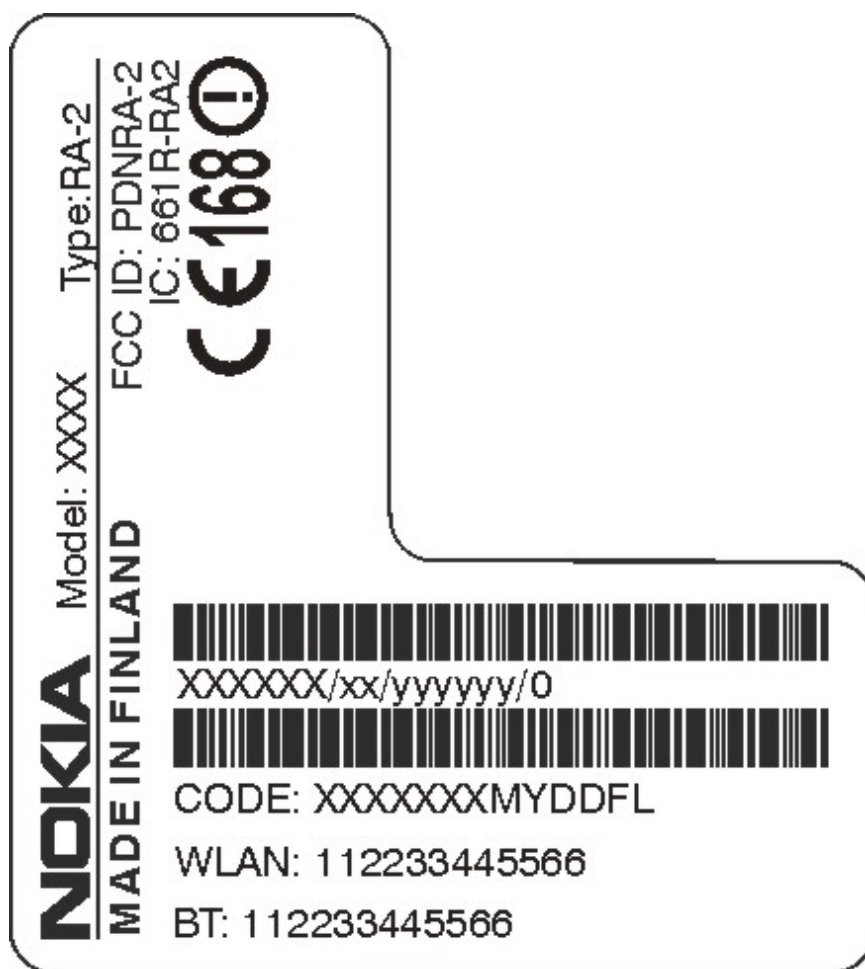
Exhibit 01: Type Label