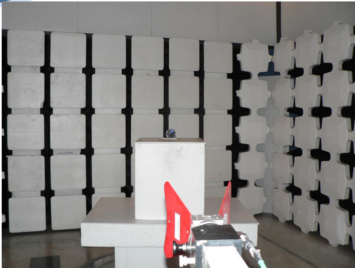
TX Spurious Emissions 1-18GHz