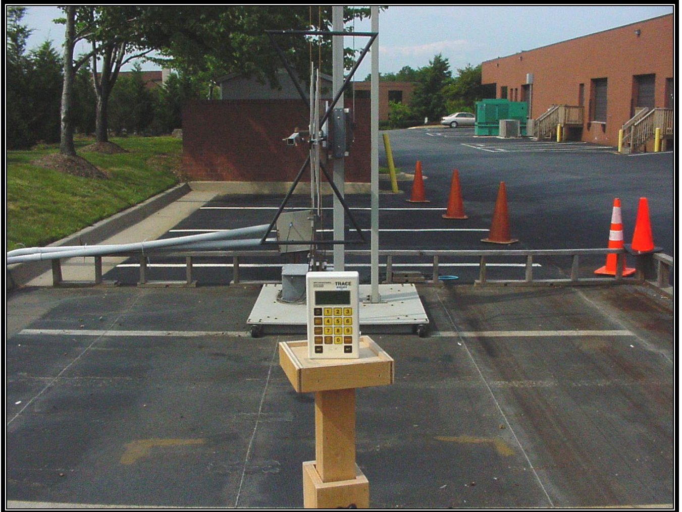
PHOTOGRAPH 3: RADIATED EMISSIONS FRONT VIEW