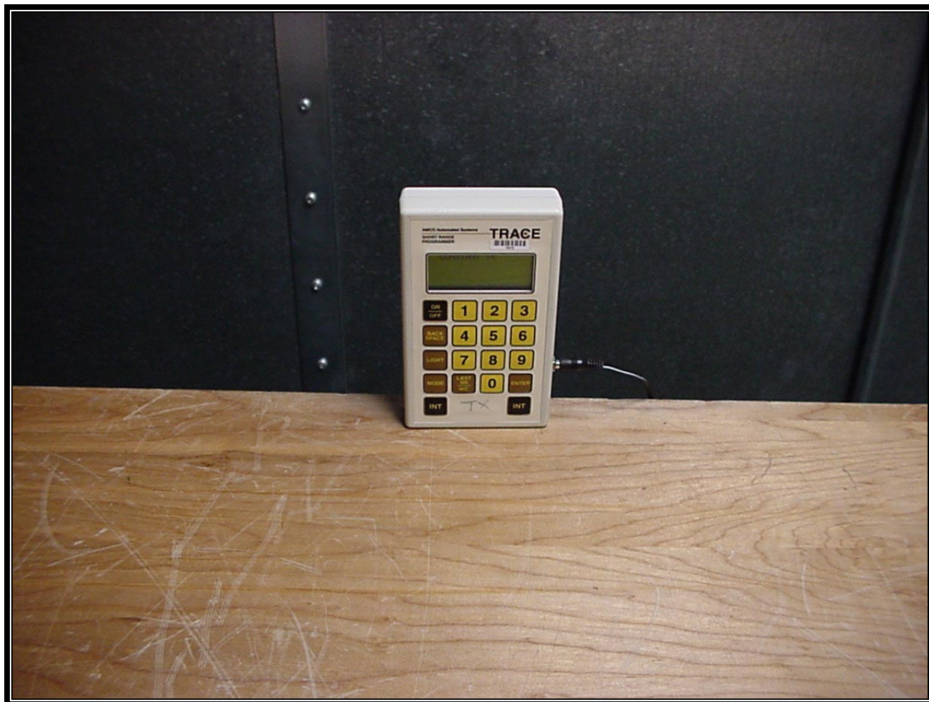
PHOTOGRAPH 5: CONDUCTED EMISSIONS FRONT VIEW