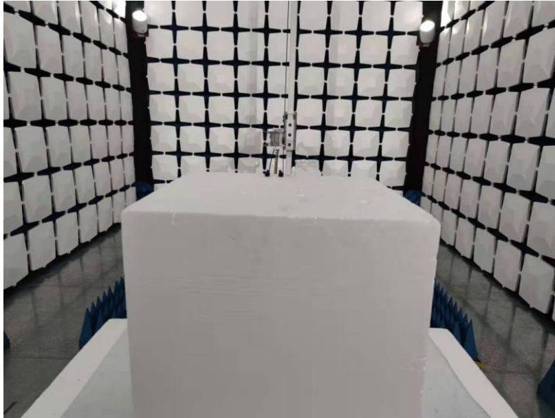
Below 1GHz for radiated emission test setup