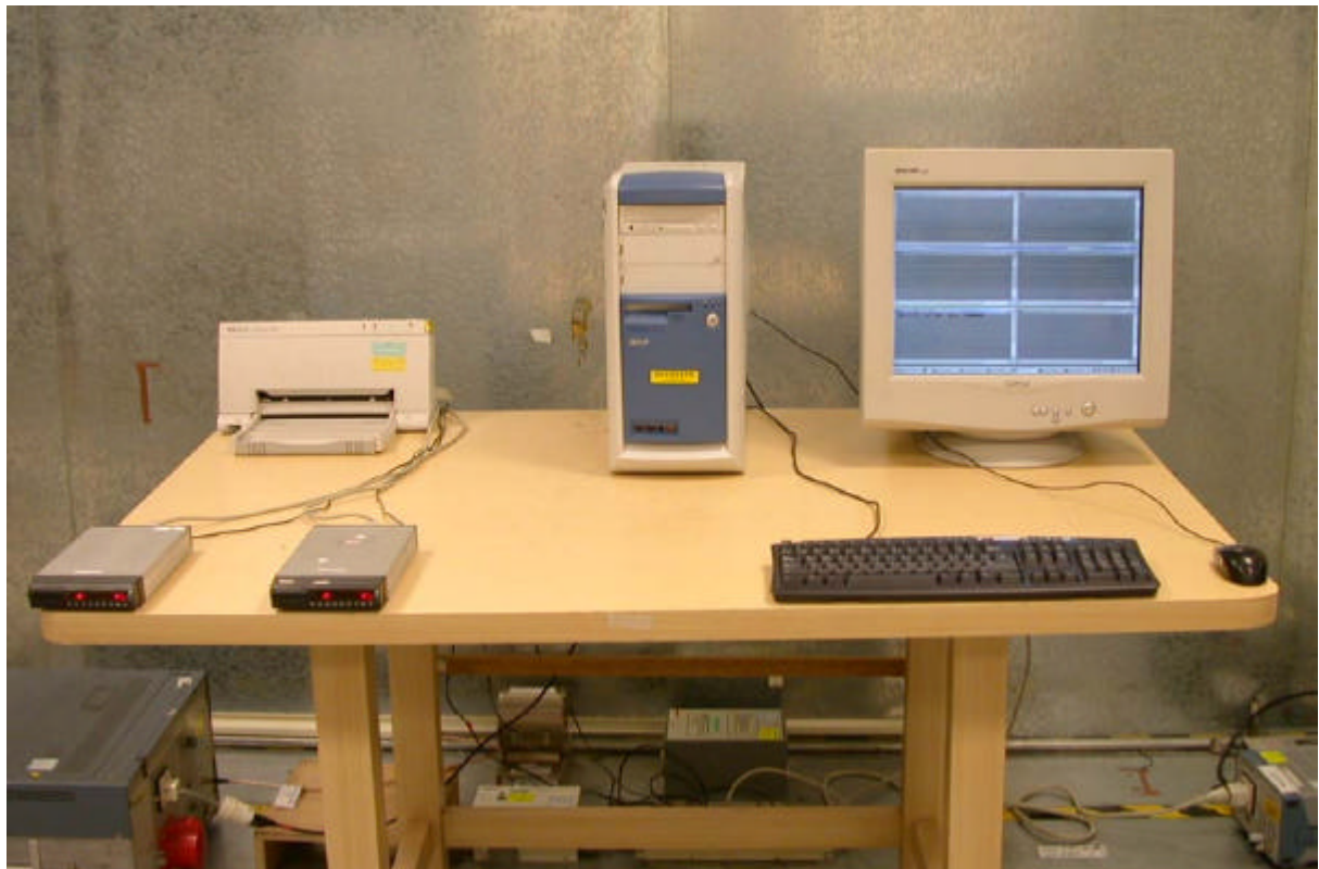
The Front View of Highest Conducted Set-up For EUT