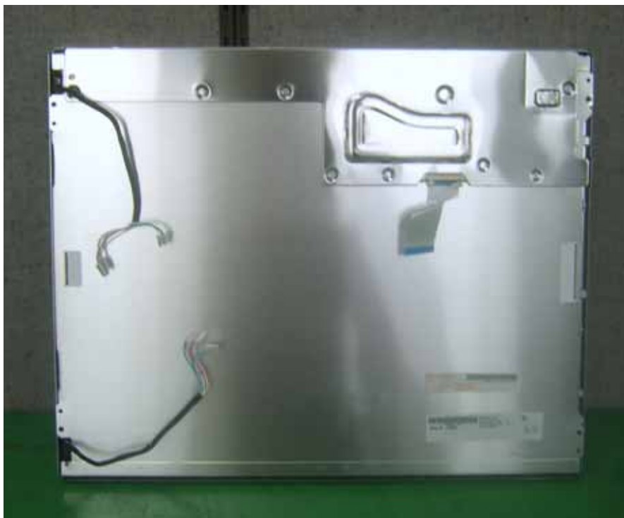
Panel rear view