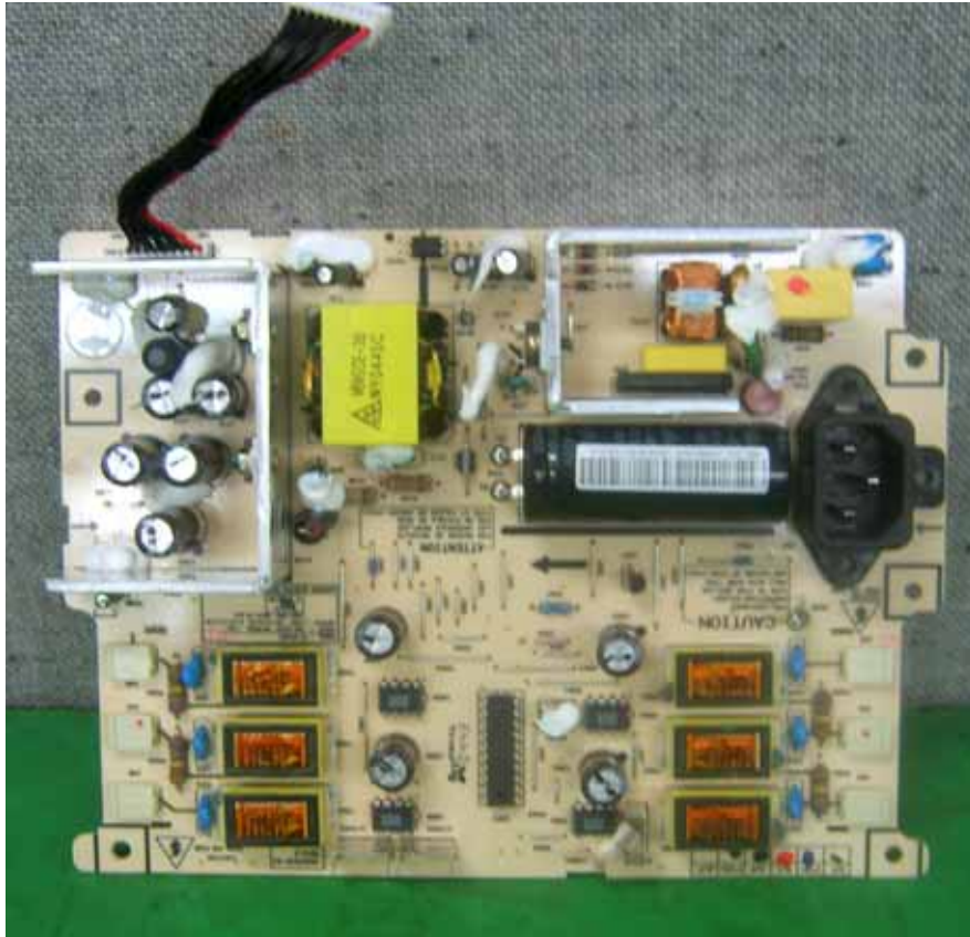
SMPS board top view