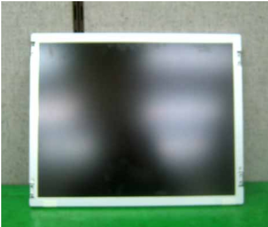
Panel front view