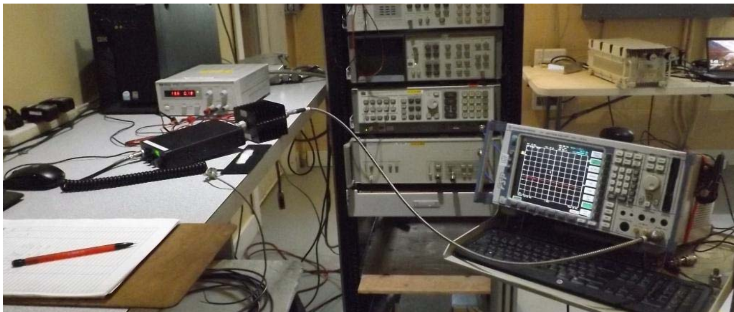
Figure E23.1 – Setup, Conducted Measurements