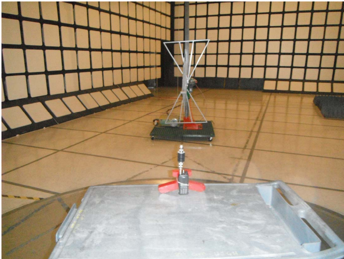
Plot #1: Tx Radiated Emission Test Setup

ICOM Incorporated VHF Transceiver, M/N: IC-F1000/F1000S/F1000T FCC ID: AFJ362000, IC: 202D-362000