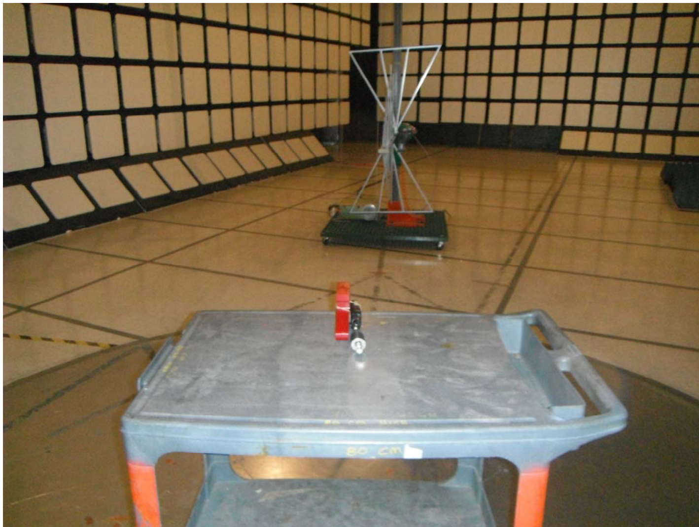
Plot #2: Tx Radiated Emission Test Setup

ICOM Incorporated VHF Transceiver, M/N: IC-F1000/F1000S/F1000T FCC ID: AFJ362000, IC: 202D-362000