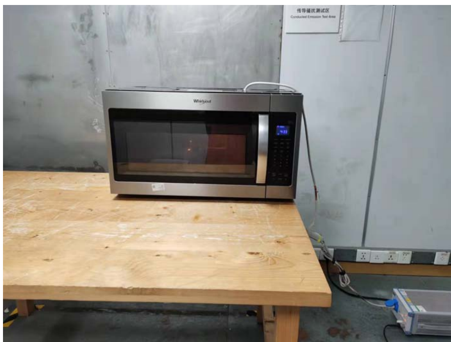
Photo of Power Line Conducted Emission Measurement