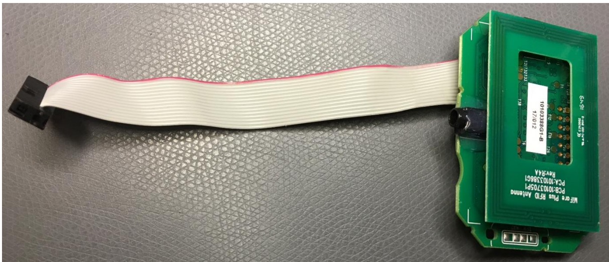
Figure 2. RFID Reader electrical assembly (with antenna), with standard RFID card