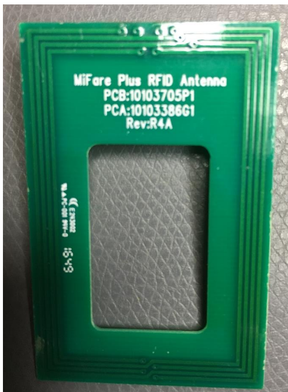
Figure 1. Left – Image of Antenna

The antenna consists of 4 interwoven loops of copper trace along the edges of the top layer of a 0.032" thick PCB. The trace length sums to a full length of 24.3 inches (61.7cm). The outer dimensions of the antenna traces are 2.025 inches by 1.285 inches (5.14cm by 3.26cm). A hole through the center of the PCB allows for potting ingress and does not affect the functionality of the antenna.