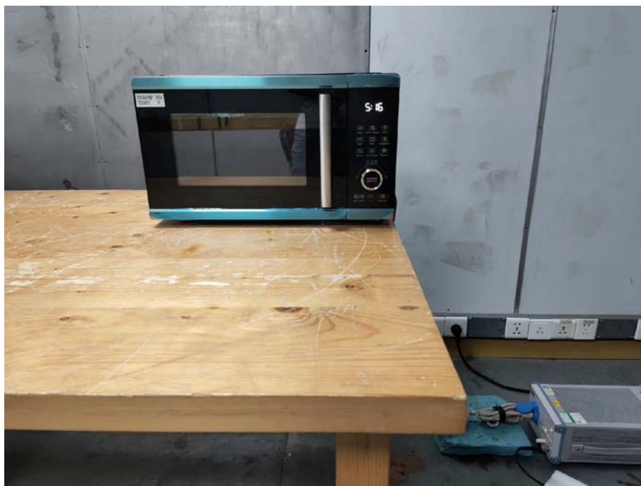
Photo of Power Line Conducted Emission Measurement