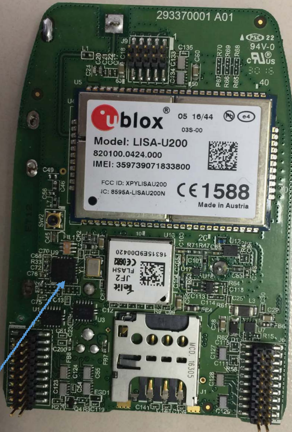
CC1101 chipset location on RF Board