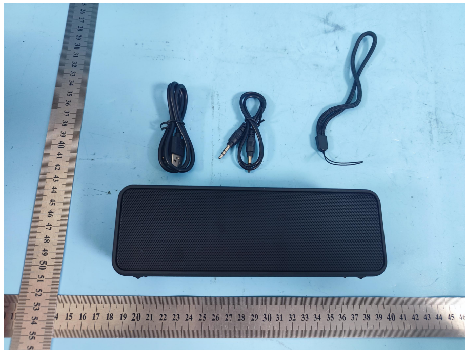
PHOTO OF THE ENTIRE SAMPLE