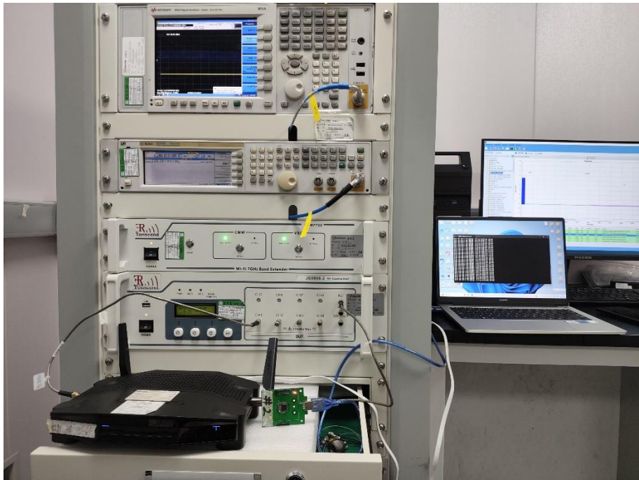
DFS Test Setup