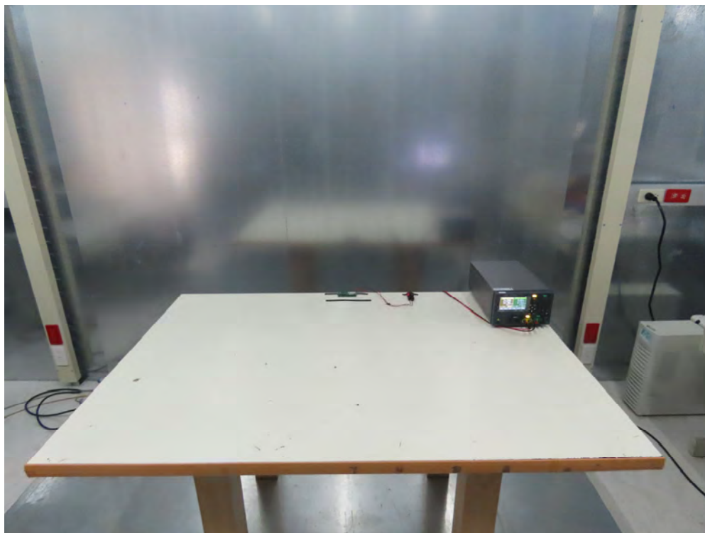
Back View of Conducted Test - PCB Antenna