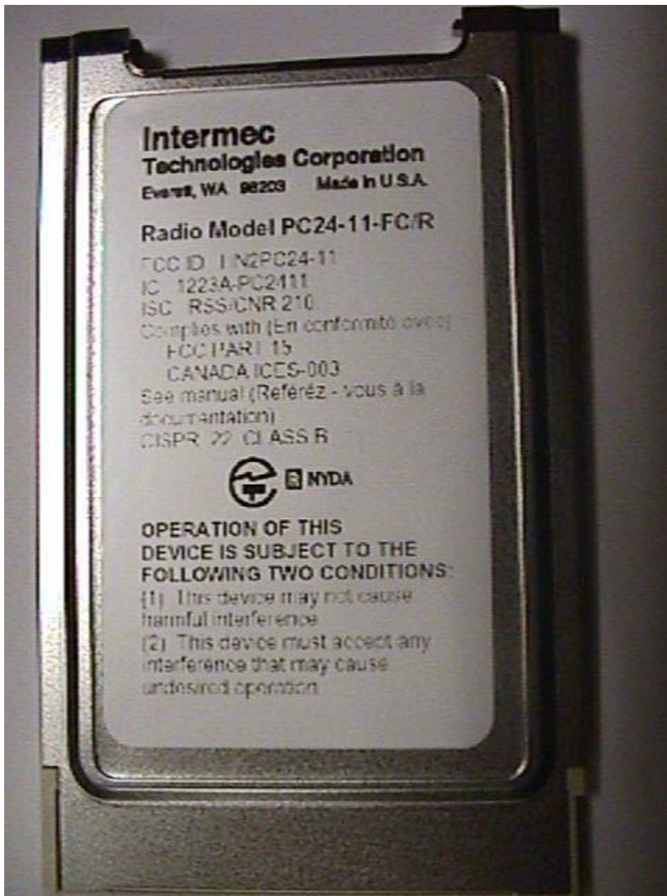
Label on radio