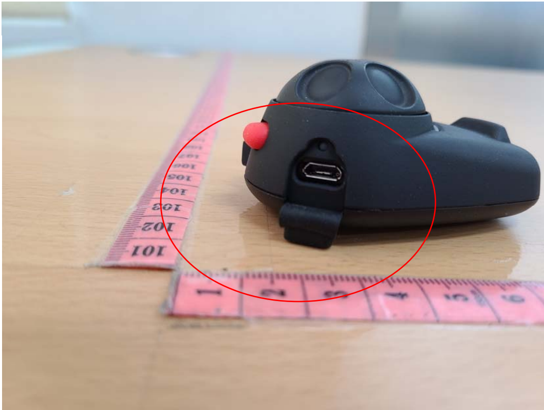
USB Port 2 (Speaker and Mic port)