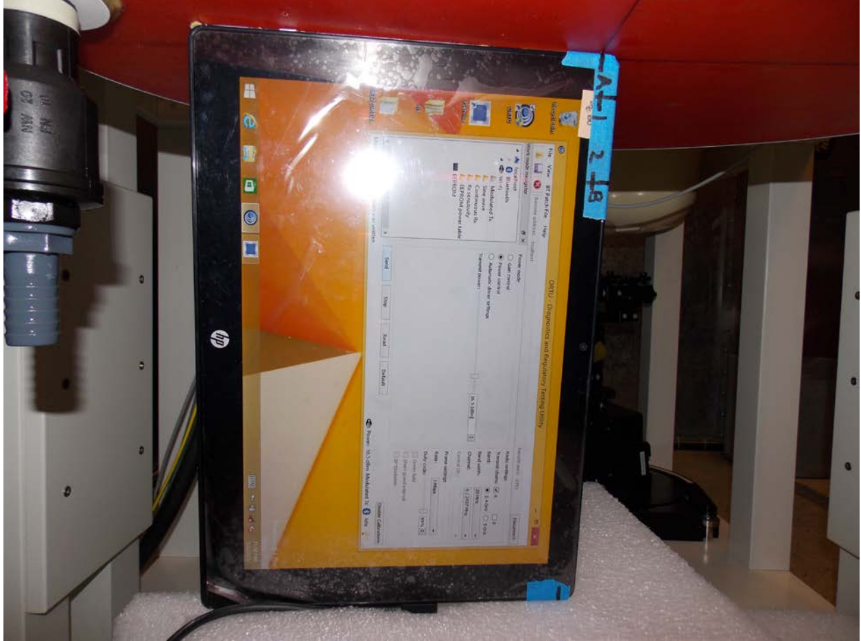
Test Position Left 0 mm Gap