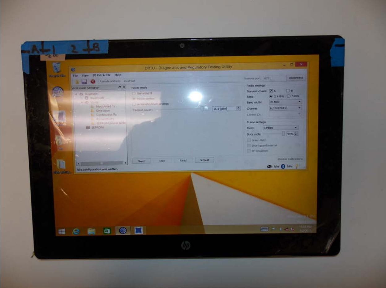
Front of Device