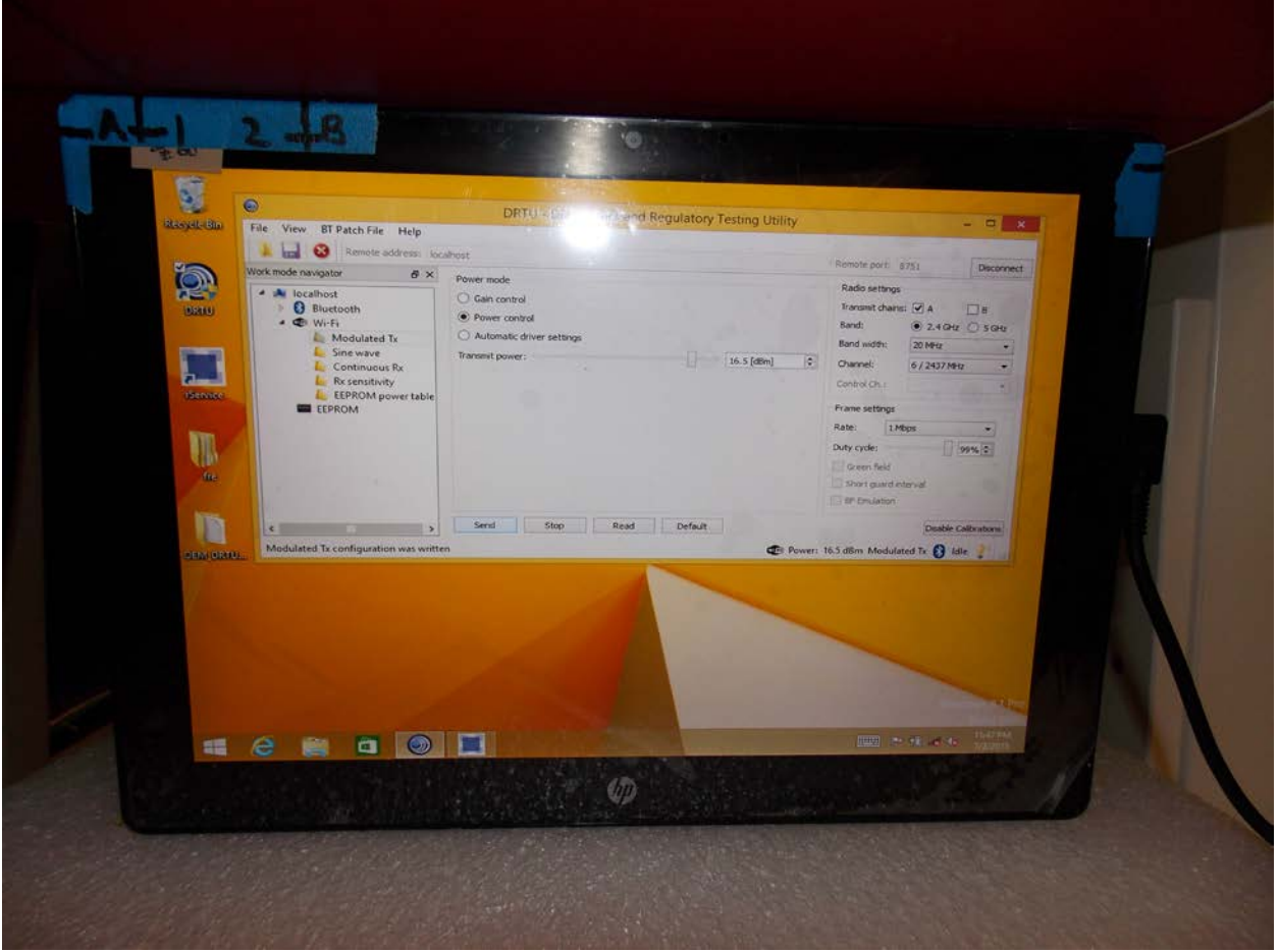
Test Position Top 0 mm Gap