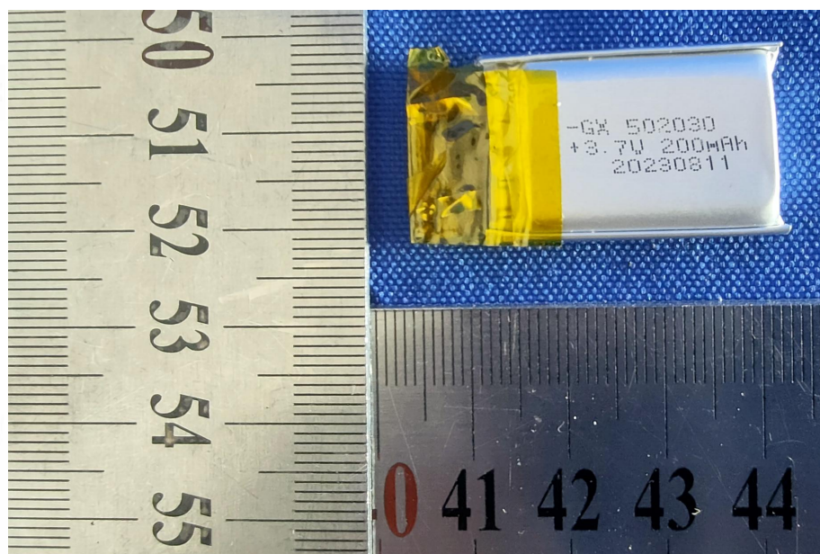
View of Product-23