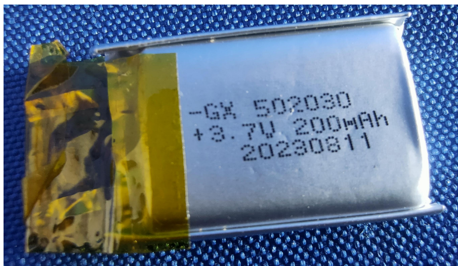
View of Product-25