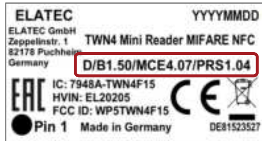
Fig. 1 - exemplary illustration

The product is delivered ex-works with a specific firmware version, which is displayed on the product label.