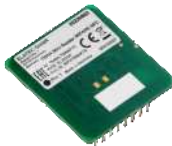
Fig. 2 - exemplary illustration

The product is delivered ex-works with a label (Fig. 1) attached on its bottom side (Fig. 2).