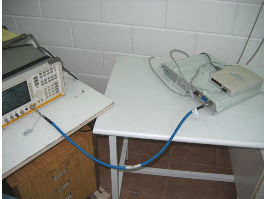
Photograph No.1 Peak output power, occupied bandwidth, spurious emissions measurement setup