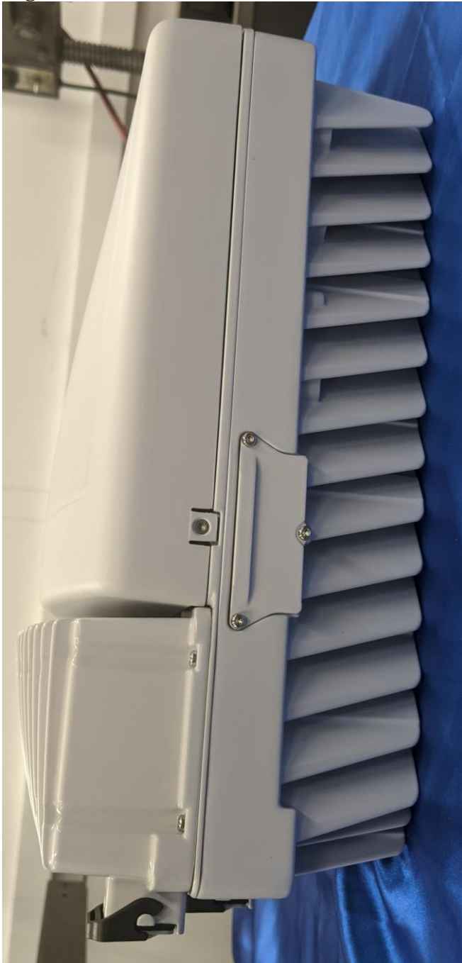
Right Side AWEWA/B (Base Unit)