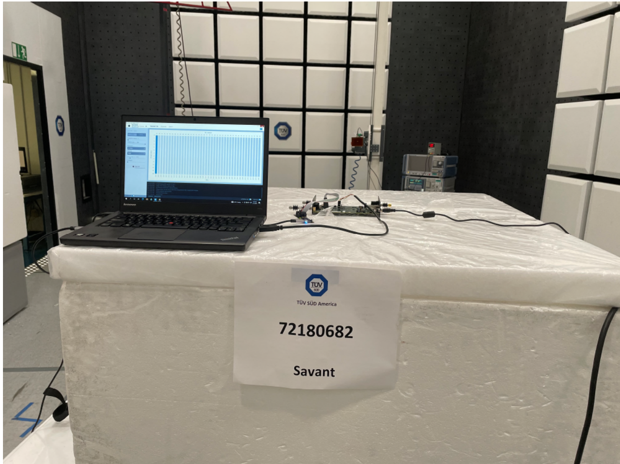
Radiated Emissions Test Setup (Back)