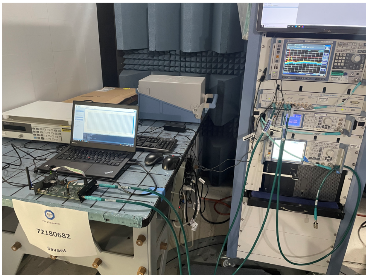
Antenna Conducted Port Test Setup