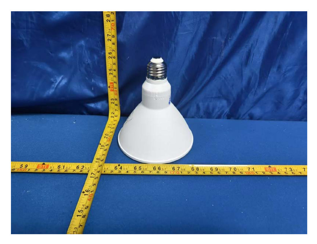
FIGURE 4 LED LAMP (G117P38MO6C) RIGHT APPEARANCE

FIGURE 3 LED LAMP (G117P38MO6C) LEFT APPEARANCE