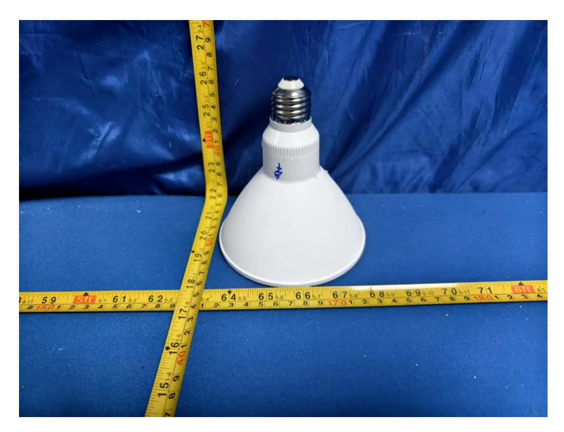
FIGURE 2 LED LAMP (G117P38MO6C) BACK APPEARANCE

FIGURE 1 LED LAMP (G117P38MO6C) FRONT APPEARANCE