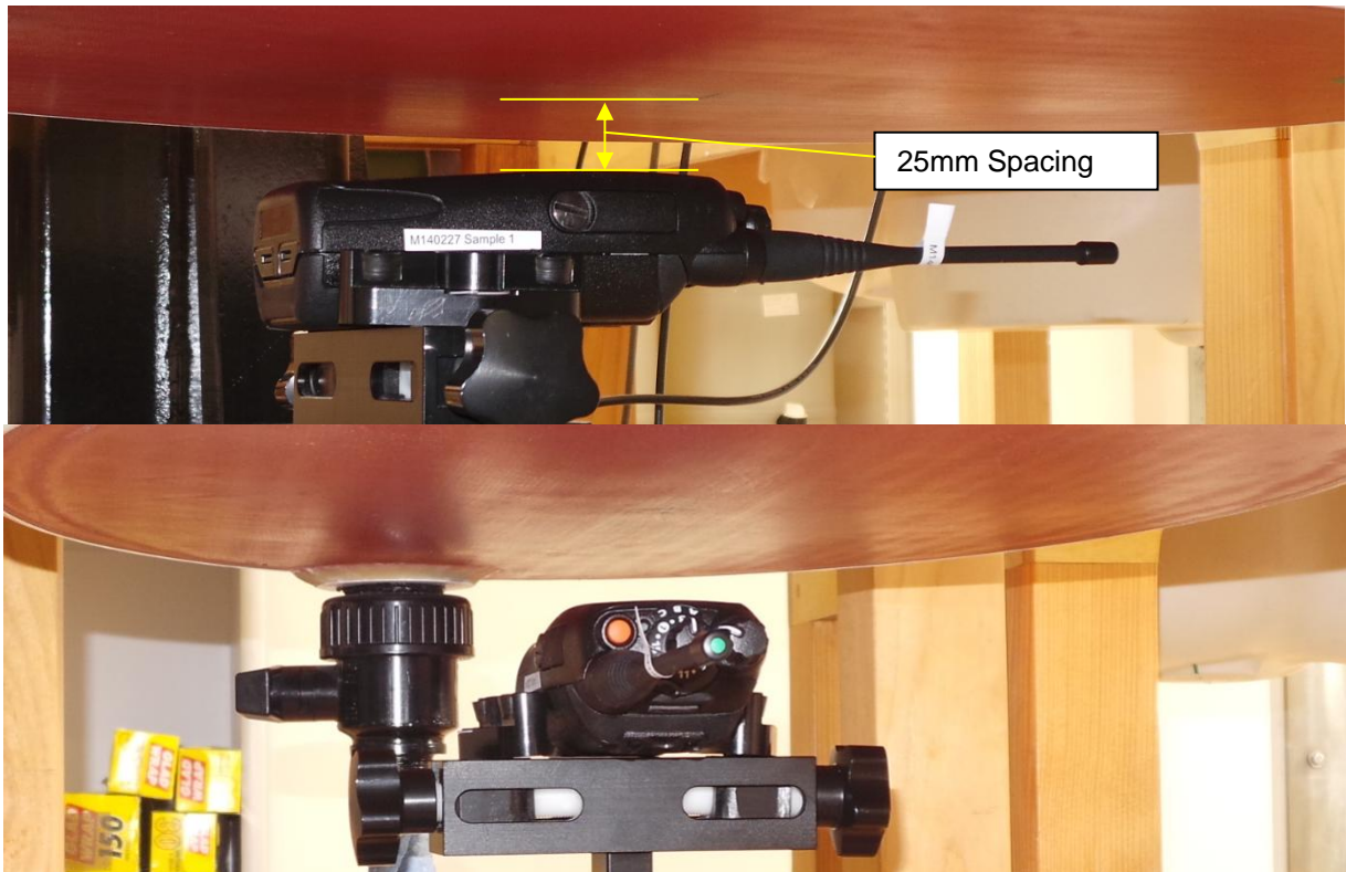
Face Frontal Position 25mm Spacing (Antenna Helical)