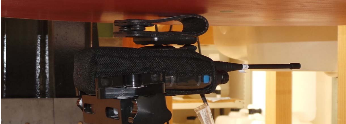
Body Worn Nylon Case D-Stud Belt Loop (Antenna Whip)