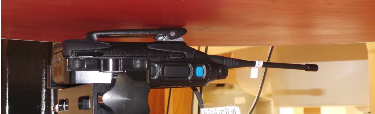
Body Worn Battery Clip (Antenna Whip)