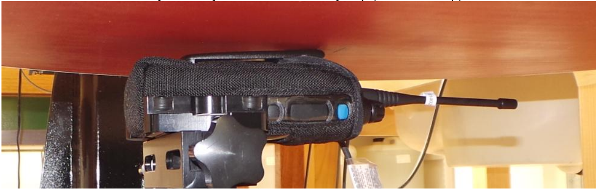
Body Worn Nylon Case with Battery Clip (Antenna Whip)