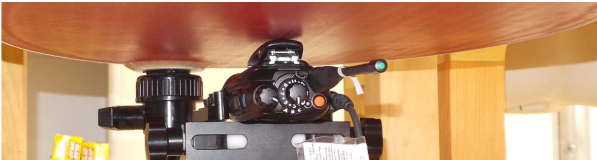
Body Worn Battery Clip (Antenna Helical)