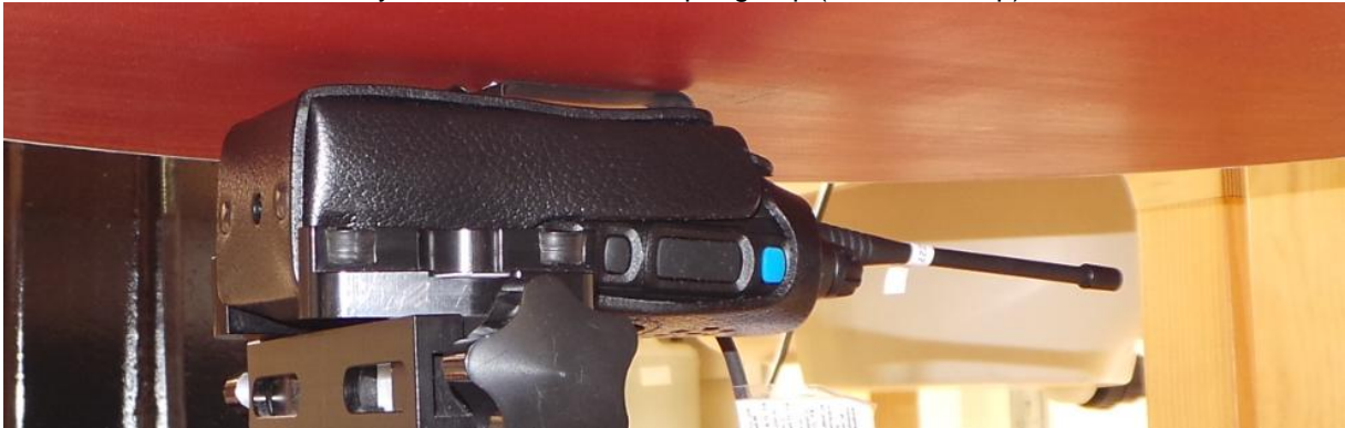
Body Worn Leather Case Spring Clip (Antenna Whip)