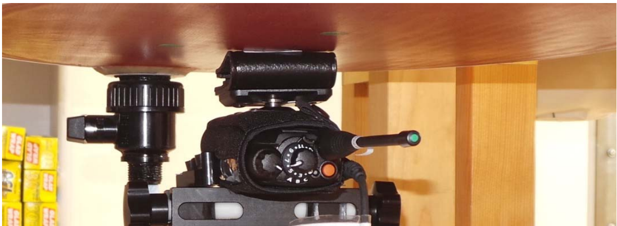
Body Worn Nylon Case D-Stud Belt Loop (Antenna Helical)