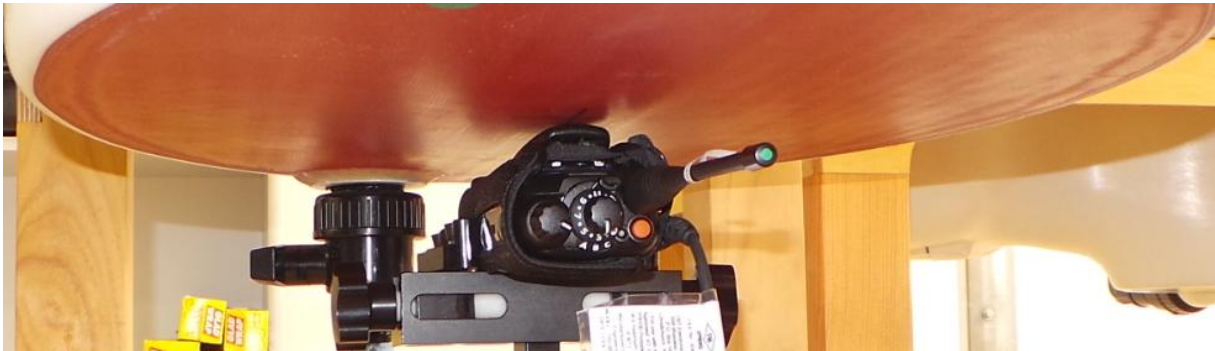
Body Worn Nylon Case with Battery Clip (Antenna Helical)