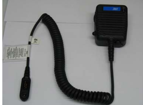
Speaker- Microphone (T03-00045-CFAA)