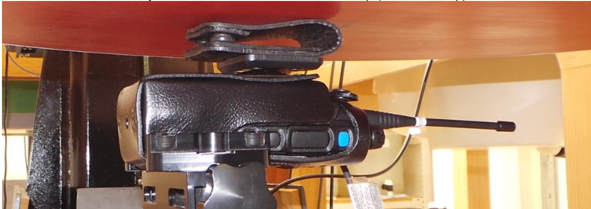
Body Worn Leather Case D-Stud Belt Loop (Antenna Whip)