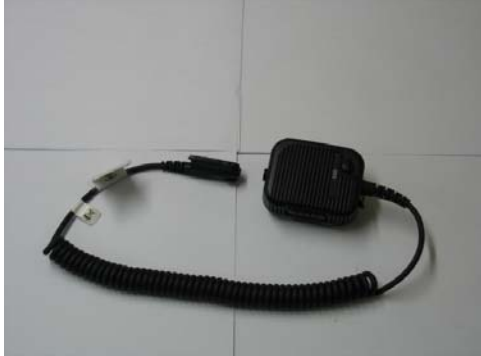
Speaker- Microphone (T03-00045-BFAA)