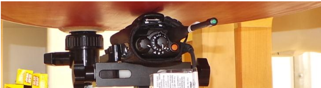
Body Worn Soft Leather Case Battery Clip (Antenna Helical)