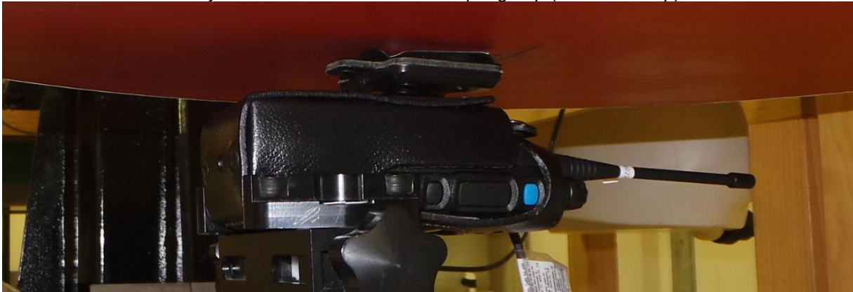
Body Worn Leather Case D-Stud Spring Clip (Antenna Whip)