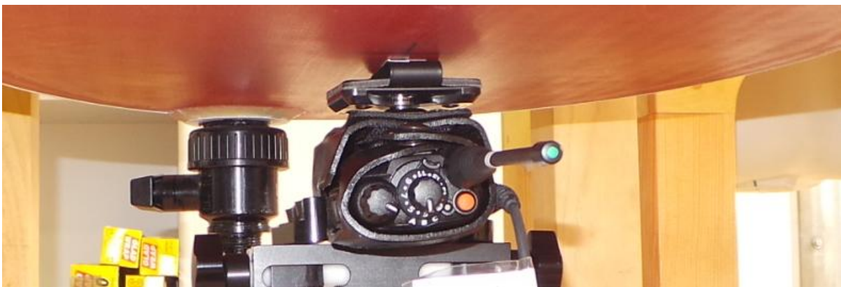
Body Worn Leather Case D-Stud Spring Clip (Antenna Helical)