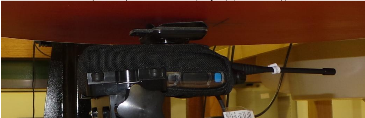
Body Worn Nylon Case D-Stud Spring Clip (Antenna Whip)