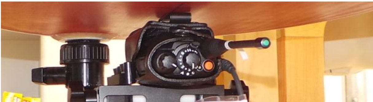
Body Worn Leather Case Spring Clip (Antenna Helical)