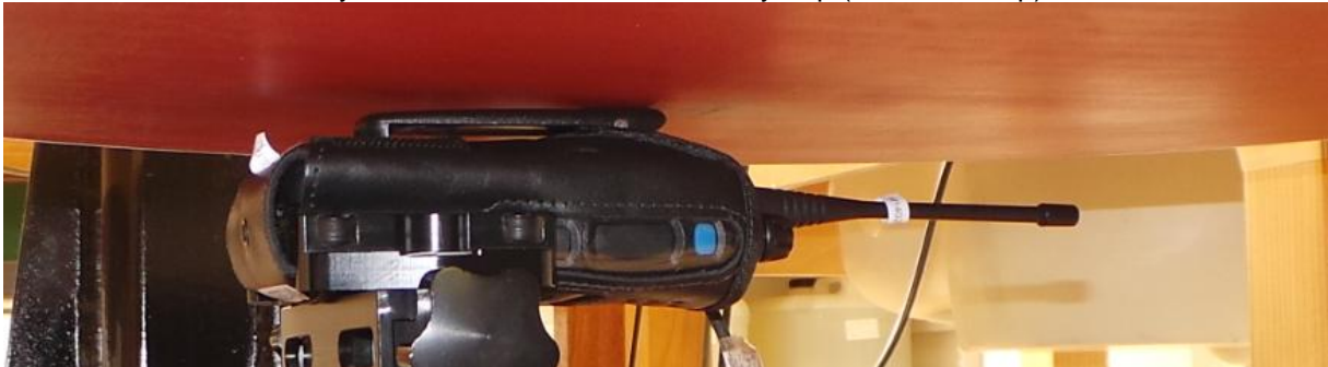
Body Worn Soft Leather Case Battery Clip (Antenna Whip)