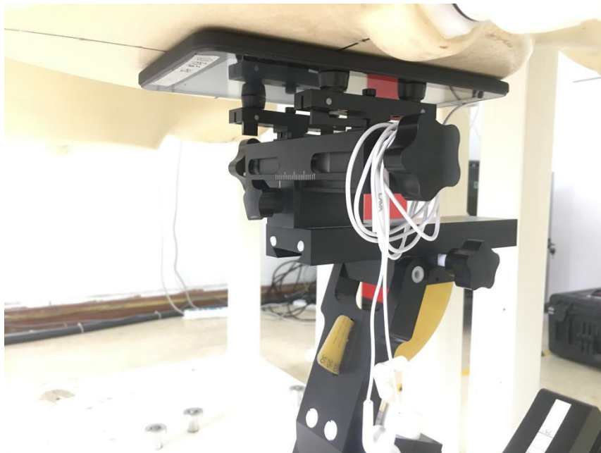
Body worn _ Back With Headset

(Test distance: 0mm, Thickness of DUT: 9mm)