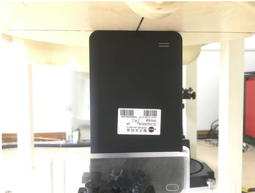
Body worn _ Bottom (Test distance: 0mm, Thickness of DUT: 9mm)