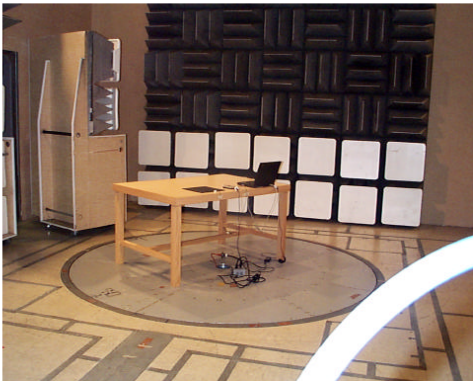
Bandwidth and Spurious Emissions