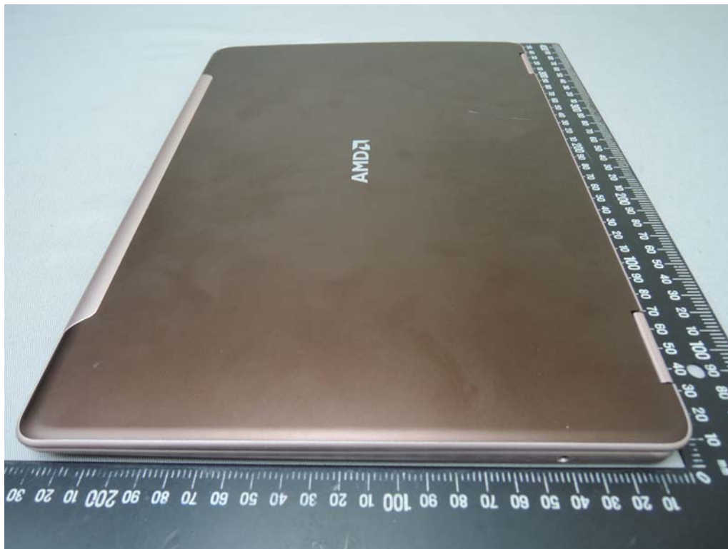
Side View of EUT –3