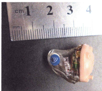
FCC ID: EOA-24GENITELCH Figure 1 left (scale in cm)