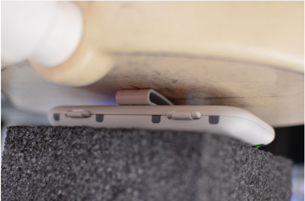
SAR Test Setup Photo 3: Body-worn – Back Side at 0 mm – with Clip