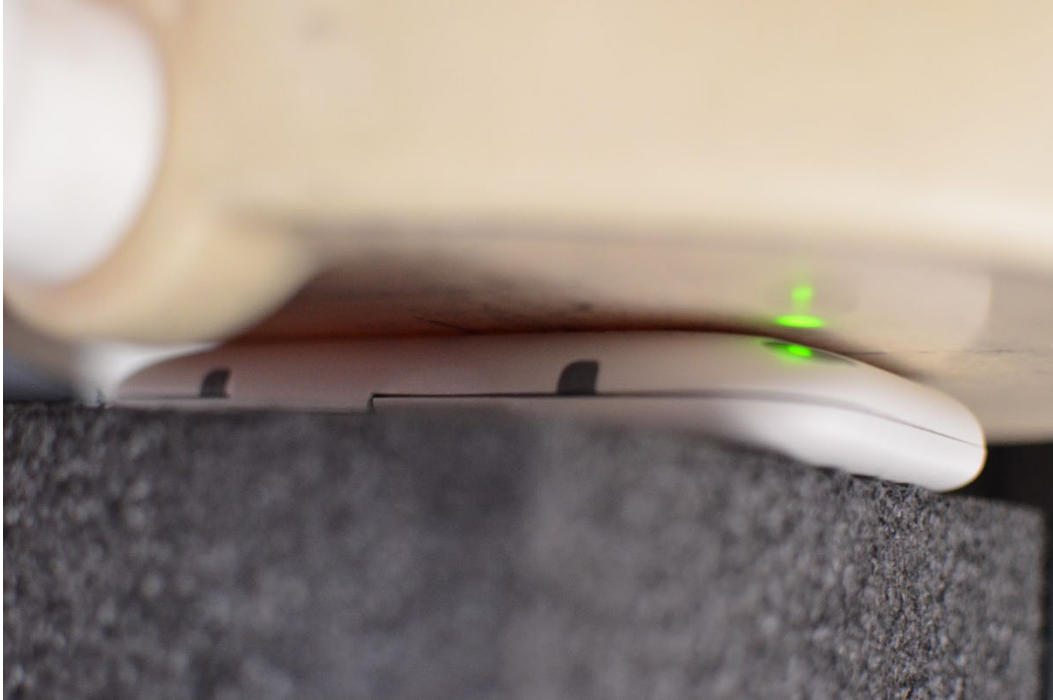
SAR Test Setup Photo 1: Body-worn – Front Side at 0 mm