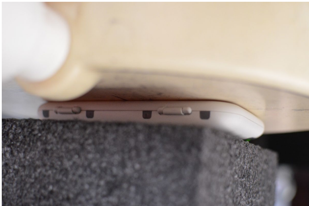
SAR Test Setup Photo 2: Body-worn – Back Side at 0 mm – without Clip