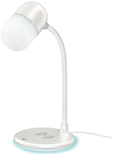
3 - IN - 1 CHARGER , SPEAKER , LAMP USER MANUAL

FCC warning Any Changes expressly or modifications not approved by the party responsible for compliance could void the user's authority to operate the equipment. This device complies with part 15 of the FCC Rules. Operation is subject to the following two conditions: (1) This device may not cause harmful interference, and (2) this device must accept any interference received, including interference that may cause undesired operation. FCC Radiation Exposure Statement: This equipment complies with FCC radiation exposure limits set forth for an uncontrolled environment. This transmitter must not be co-located or operating in conjunction with any other antenna or transmitter. This equipment should be installed and operated with minimum distance 20cm between the radiator &you body.