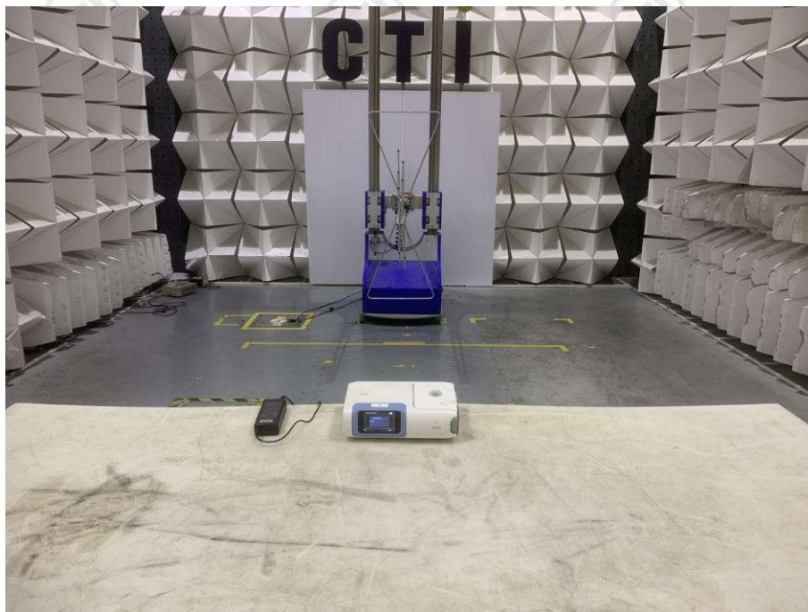
Radiated spurious emission Test Setup-1(Below 1GHz)