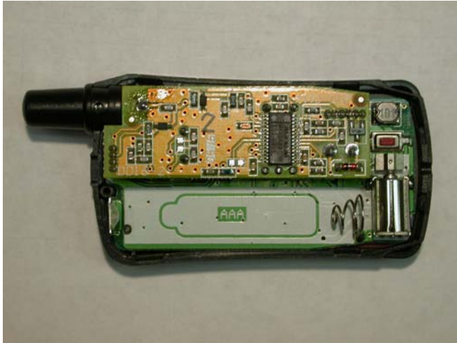
Photo 7 Main PCB and RF daughterboard PCB assemblies in top plastic case housing.