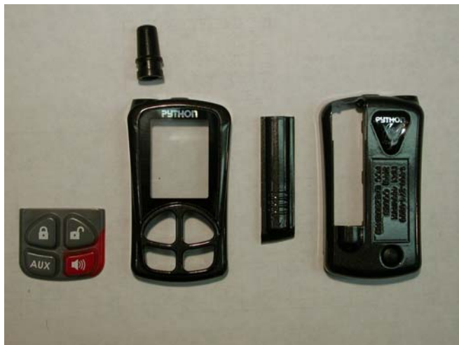
Photo 9 Exploded view of plastic case assembly