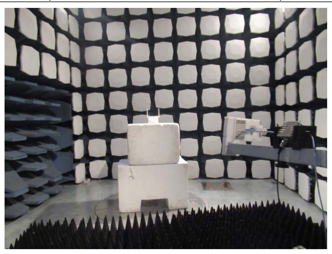
18GHz - 26.5GHz Picture 1 Radiated Emission Test Setup