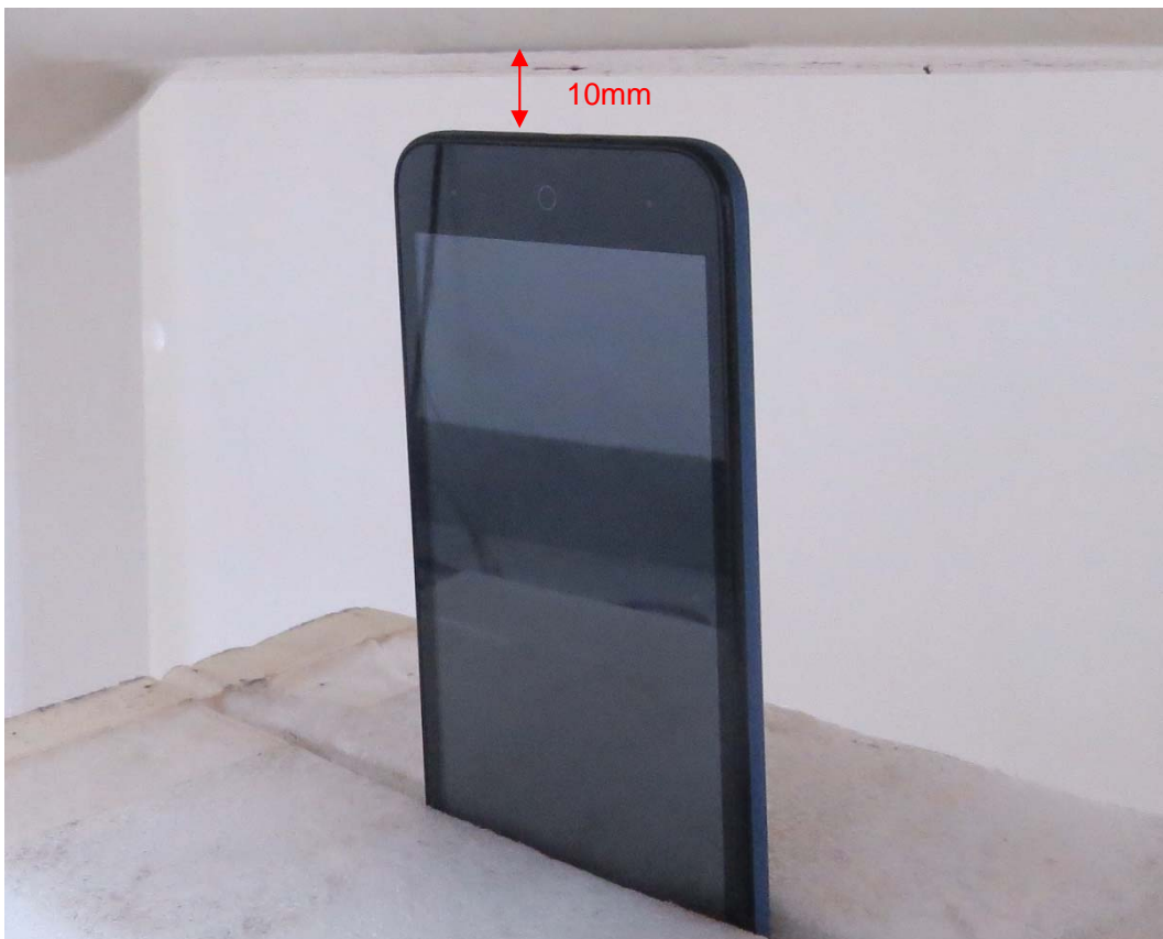
Picture 10: Bottom Side, the distance from handset to the bottom of the Phantom is 10mm