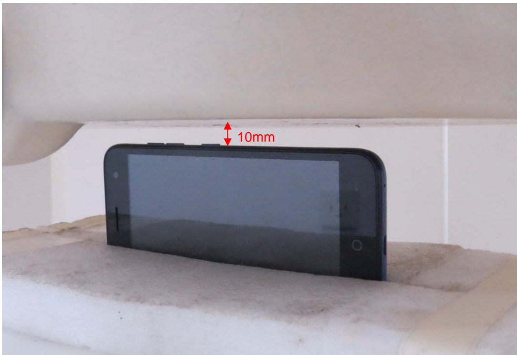
Picture 8: Right Side, the distance from handset to the bottom of the Phantom is 10mm