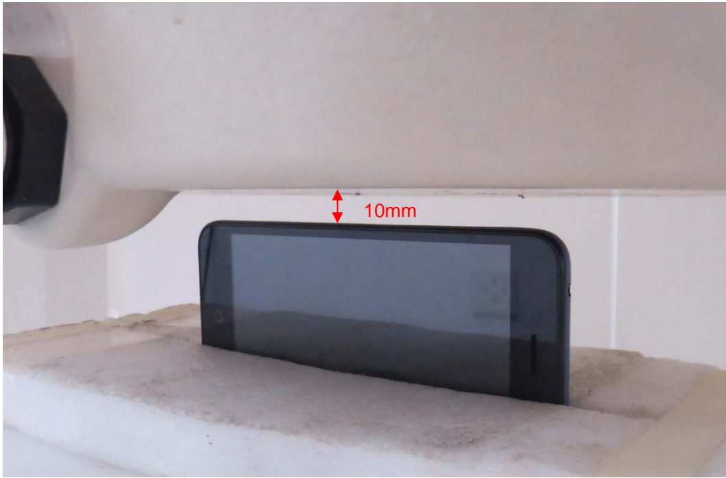
Picture 7: Left Side, the distance from handset to the bottom of the Phantom is 10mm