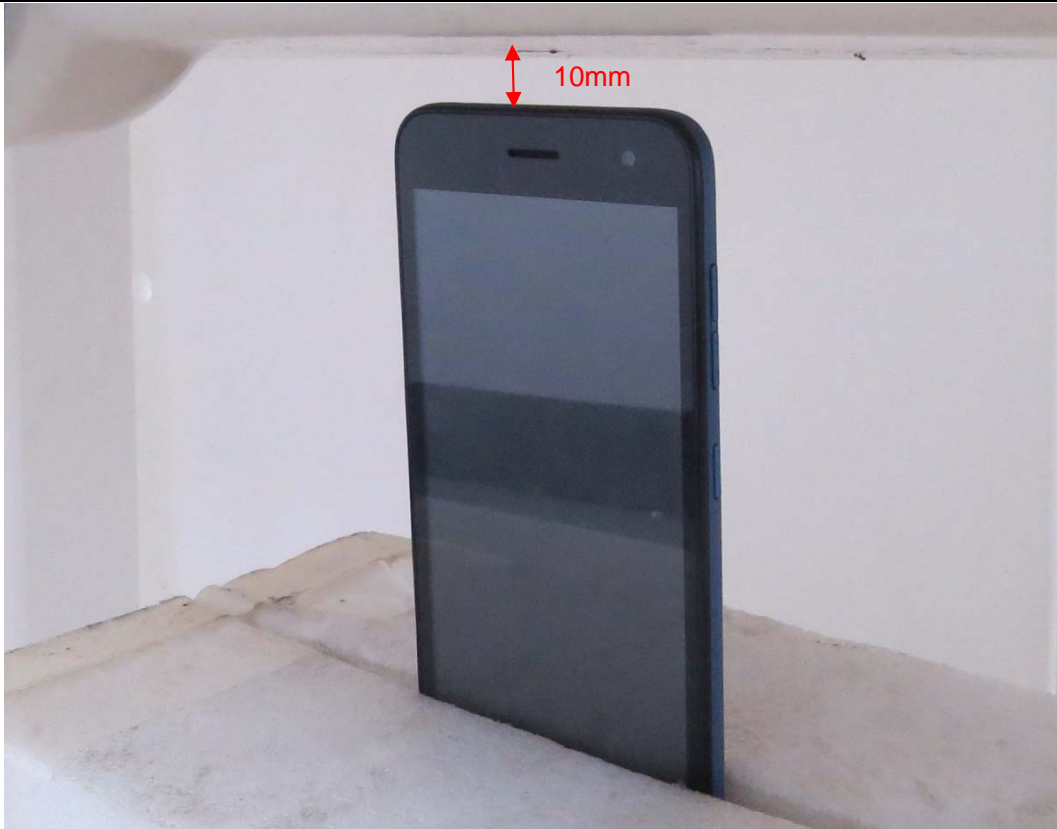
Picture 9: Top Side, the distance from handset to the bottom of the Phantom is 10mm