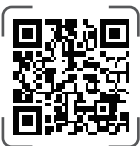
Govee Home App

For FAQs and more information, please visit: www.govee.com