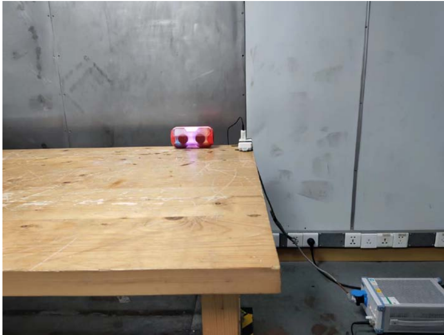
Photo of Power Line Conducted Emission Measurement