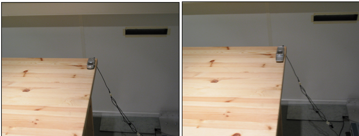
Picture 1 AC powerline conducted emissions. Flap closed and open