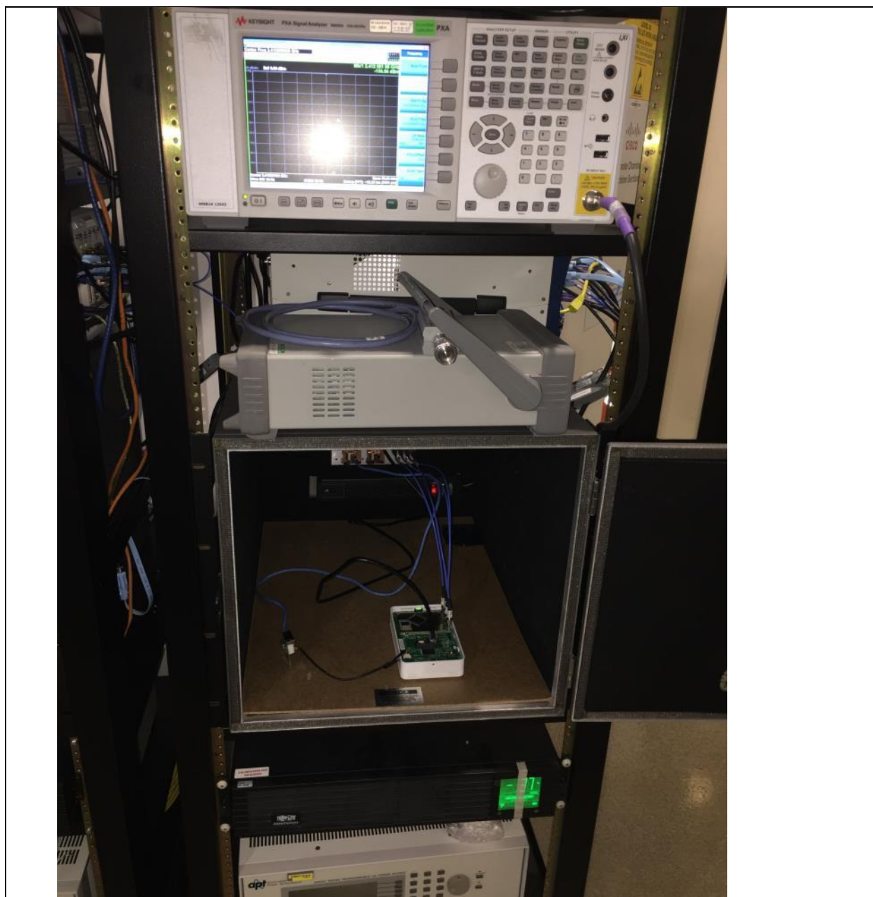
Title: Conducted Test Setup

This is a dual band 2.4GHz / 5GHz device. All ports in this test set up photo are connected as all testing is automated. Section 2.6 of this test report given an overview of the different Tx antenna combinations used by this device.